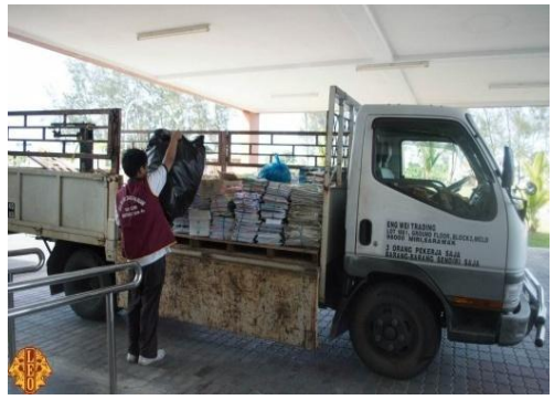
Leo Club of Kolej Tun Datu Tuanku Haji Bujang's Recycling Project to promote a healthier environment as well as sensitive and responsible towards climate issues /changes.