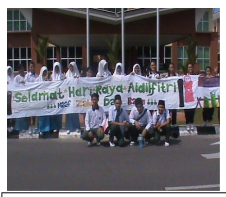
Students worked together to produce joint extra banner Hari Raya- A sign of gratitude and respect for other people