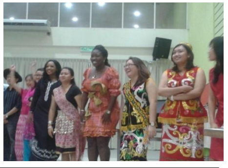
The integration program- To produce students who can love the country and the nation.