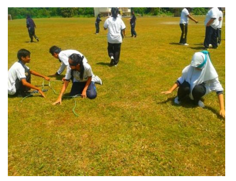
Class monitor Leadership Course-To produce leaders with good leadership skill and are cares, responsible and trustworthy.