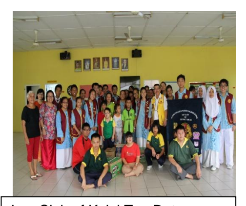
Leo Club of Kolej Tun Datu Tuanku Haji Bujang's visited and gave Donation to Sunflower Centre, Miri