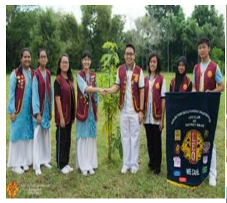
Leo Club of Kolej Tun Datu Tuanku Haji Bujang's Handing Over of Past Key Officers Family Trees to the New Key Officers