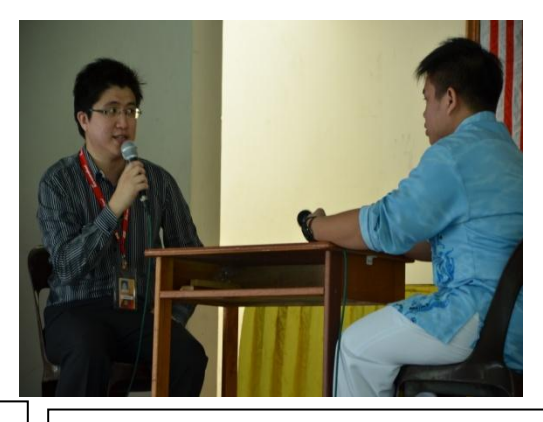
Interview Workshop- To produce students who are confident and well prepared before venturing into a career