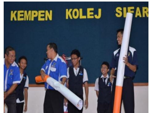
Anti-smoking campaign- To create a college with healthy learning environment.