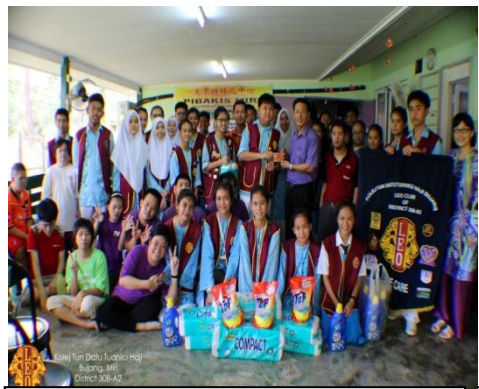
Leo Club of Kolej Tun DatuTuanku Haji Bujang's visited and gave Donation to (Pusat Pemulihan Dalam Komuniti)(PDK Centre)