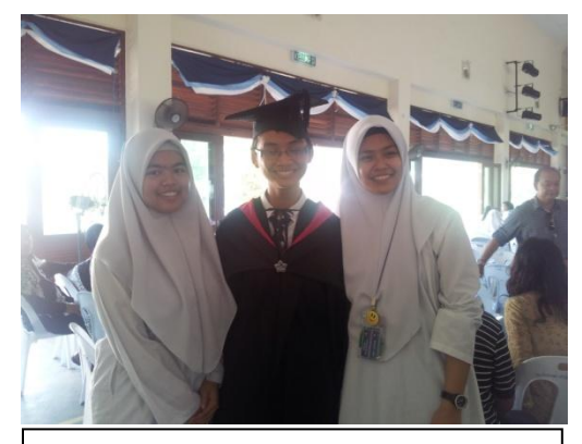
Student Excellence Awards Ceremony is held annually- To recognize students who excel in all aspects be it academic, cocurricular and personal development